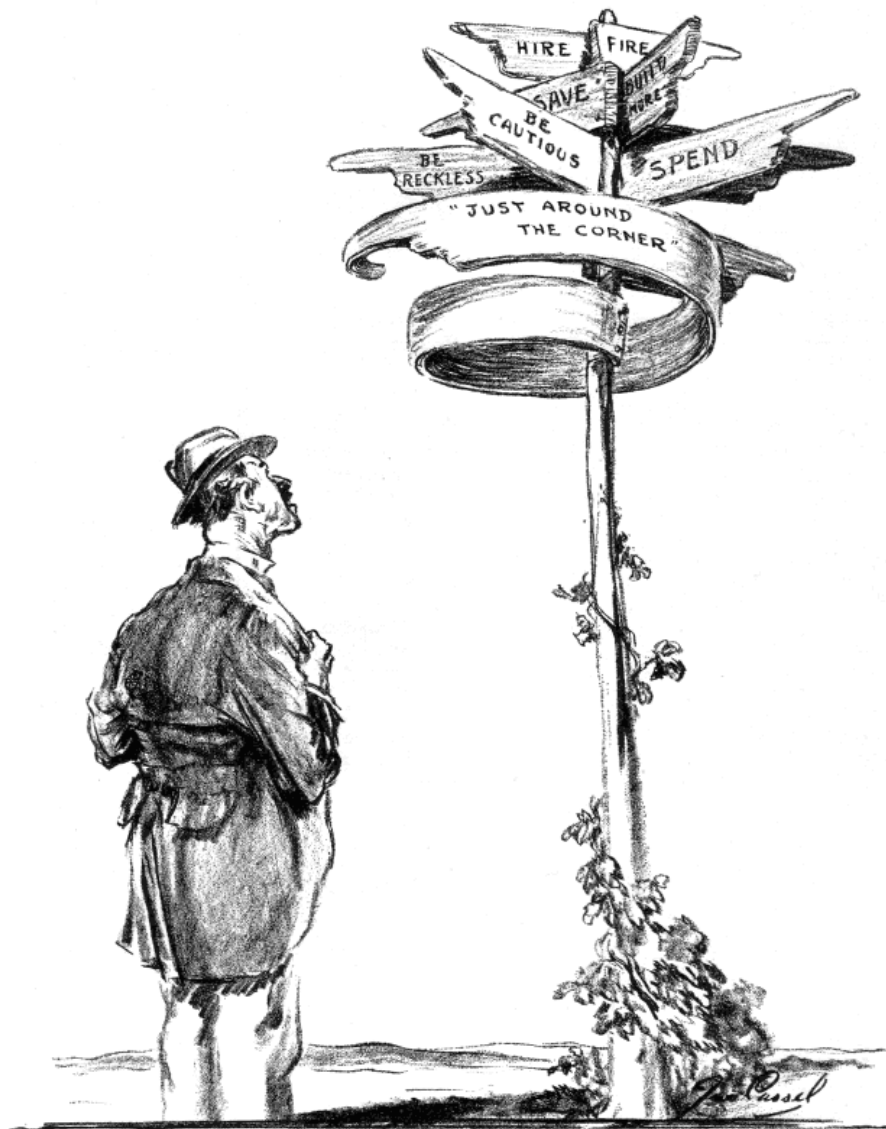
THE WAY TO PROSPERITY.