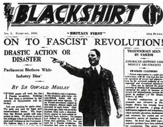
Oswald Mosley depicted in the notorious publication of the British Union of Fascists, Blackshirt .

In 1920s and early 1930s Britain, a range of small fascist groupings emerged. These included the British Fascisti, the Britons Society, the English Mystery and the Imperial Fascist League. It was not until Oswald Mosley developed his New Party in 1931, and then British Union of Fascists (BUF) a year later that far right politics gained wider traction in Britain. The BUF grew rapidly in its early days, in part thanks to the support from the Rothermere Press – as well as growing concern with the direction of mainstream British politics and its handling of the economy during a period of economic crisis. The BUF quickly grew to around 50,000 members, until violence began to tar the movement, like at a notorious ‘Olympia rally’ in June 1934. Largely from this point on, the BUF received negative media coverage and a haemorrhaging support base. In particular, the movement’s swift recourse to violence was seen as contrary to British values.