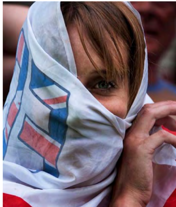
Female English Defence League member marching to 'Ban the Burka' in Westminster, July 2010.