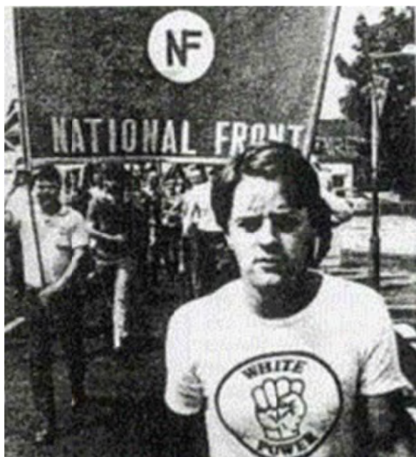
A young Nick Griffin marching with the National Front in 1983.

Conservative Party appeared weak on the issue of immigration, and moving into this political space became a key factor for the rise of the National Front across the 1970s. The movement largely appealed to often working-class, disenchanted Conservative voters, as well as Labour supporters, both fearful of immigration and a loss of national identity. Developments such as the arrival of Ugandan Asians added further fuel for NF rhetoric across the 1970s. This issue, combined with the relatively successful adoption of 'march and grow' tactics witness a rise in momentum throughout the decade; in fact, at its height in the mid 1970s, the NF boasted some 14,000 paying members. In consequence, a more populist 'front stage' agenda espousing anti-immigration policies, underpinned by a neo-Nazi 'back stage', defined the ideology of the National Front.