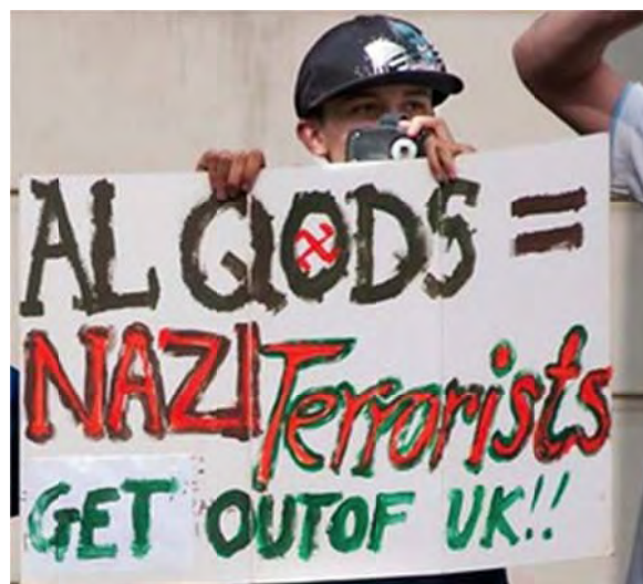
Joint English Defence League, March for England and English Nationalist Alliance protest against an Al-Quds Day march, September 2010.

protests were not violent, and even distanced themselves from the occasional interest of the extreme right-wing movement, the National Front, which tried to associate with these protests. 18 March for England was originally made up of former soldiers and former football hooligans, a somewhat distinct grouping from traditional far right supports. Although not now directly associated with the EDL, March for England still hold events. 2010 demonstrations in Brighton, for example, sought to ban EDL members. 19 Despite not being a formal part of the EDL, March for England has continued to protest along broadly cognate, ultra-patriotic and anti-Muslim lines, a fact that again points to the complexity of a social movement wider than just the EDL. Such smaller organisations, similar in nature to the EDL, also operate – often with links blurred at the grass-roots level. Closer examination highlights that the EDL is not a single, clear organisation, but rather a complex patchwork of networks held together by a centralised Social Movement Organisation. To a greater or lesser extent affiliated with the EDL, these wider groupings also gravitate around the core themes of street protests, anti-Muslim sentiment, and populist ultra-patriotism.