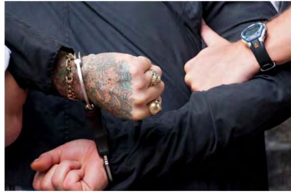
English Defence League supporter being arrested.