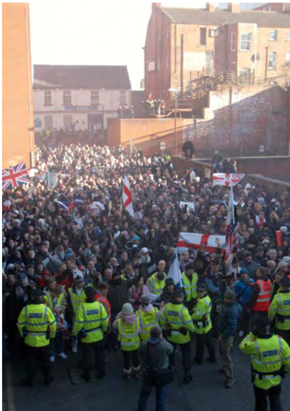
Police at an English Defence League march in Preston, November 2010.