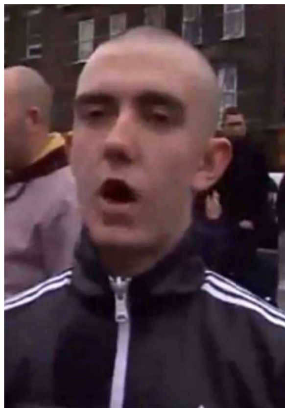
A still taken from the 'Muslimic Rayguns' YouTube film.