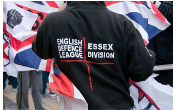
Local English Defence League division member marching on September 11, 2010.

The movement survived the leadership crisis of 2010, and Lennon emerged from it with a more commanding hold over the organisation. Indeed, messages from Lennon at this time reveal the lack of control he had over the wider organisation. For example, he was unaware of exactly how many divisions were active, and what their future plans were.