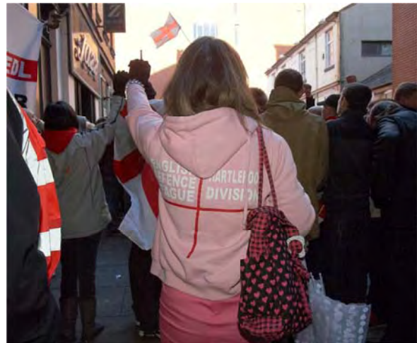
Supporters at an English Defence League march in Preston, November 2010.

A large demonstration by over 1,000 English Defence League supporters was held in Preston. Once again, around 150 UAF supporters opposed the EDL. Some minor scuffles occur, but generally peace was maintained throughout the day.