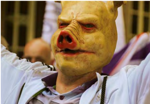
An English Defence League protestor wearing a pig's head mask at the Tower Hamlets demonstration in September 2011.

350 English Defence League members demonstrated in Telford and were countered by approximately 250 opposing demonstrators. Police reported sporadic small-scale skirmishes throughout the 4-hour demonstration. 35